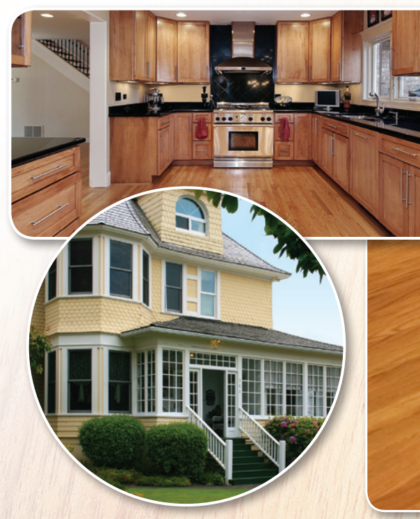
WOOD PRIDE Exterior Solid Color Siding Stain

WOOD PRIDE Interior Wood Finishing Stain