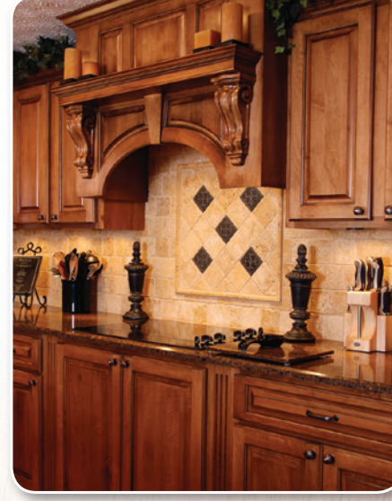
WOOD PRIDE Interior Wood Finishing Stain