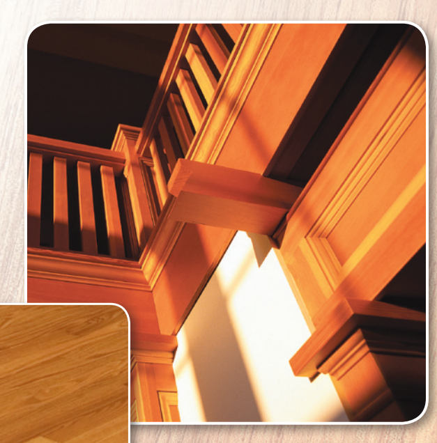
WOOD PRIDE Interior Crystal Clear Varnish

WOOD PRIDE Interior Semi-Transparent Stain